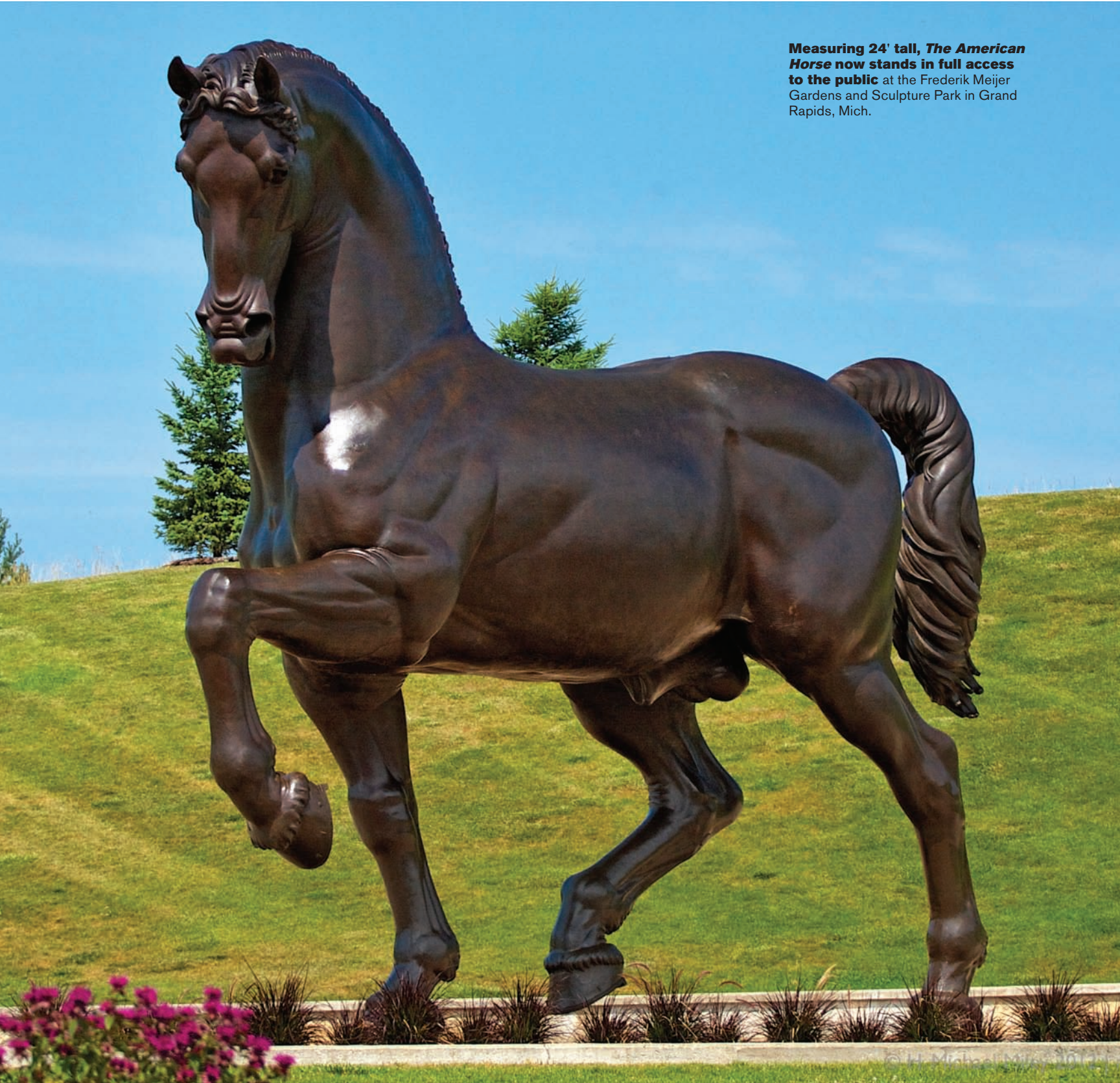
Measuring 24' tall, The American Horse now stands in full access to the public at the Frederik Meijer Gardens and Sculpture Park in Grand Rapids, Mich.